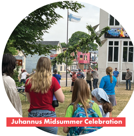
Juhannus Midsummer Celebration

RE-OPENING CEREMONY for the Finnish American Heritage Center on Friday, April 12th at 1:30 pm. Guest speakers, performances, flag raising, and ribbon cutting with the Finlandia Foundation National Board Members are scheduled.