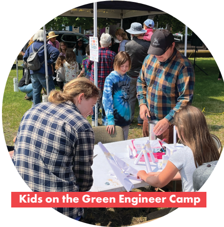
Kids on the Green Engineer Camp