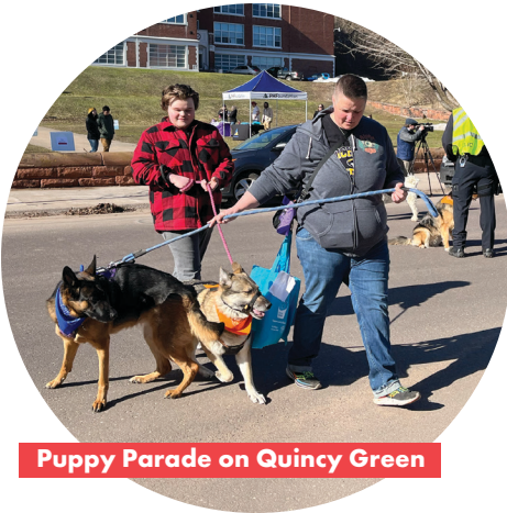
Puppy Parade on Quincy Green